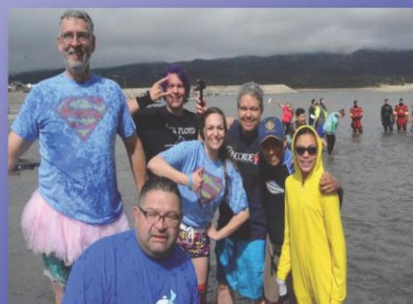
Special Olympics Polar Plunge

Frank Nigro Columbian Foundation Supporting People with Intellectual Disabilities