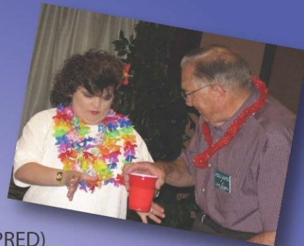
Special Religious Development (SPRED)

HELPING PEOPLE WITH INTELLECTUAL DISABILITIES KNIGHTS OF COLUMBUS