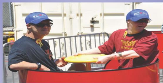
Day of Sharing

Special Olympics St Madeleine Sophies Center Schelby School Noah Homes