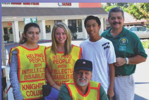
Intellectual Disabilities Drive

Your donations supported over 170 programs throughout California