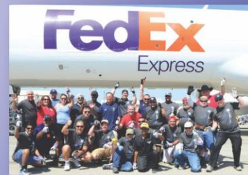
Special Olympics Plane Pull

Thank You Knights of Columbus for Supporting Us